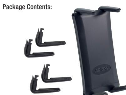
SM060-2 Slim-Grip® Ultra™ Universal Smartphone & Tablet Holder

IMPORTANT: Select the appropriate short or long support legs and install to holder. For large sized smartphones such as the Galaxy Note II and mid-sized tablets, select 4 long support legs.