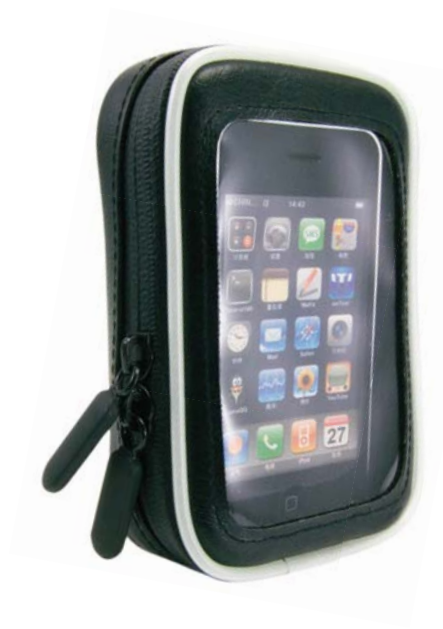
SM-WPCS Water-resistant Mobile Phone Case